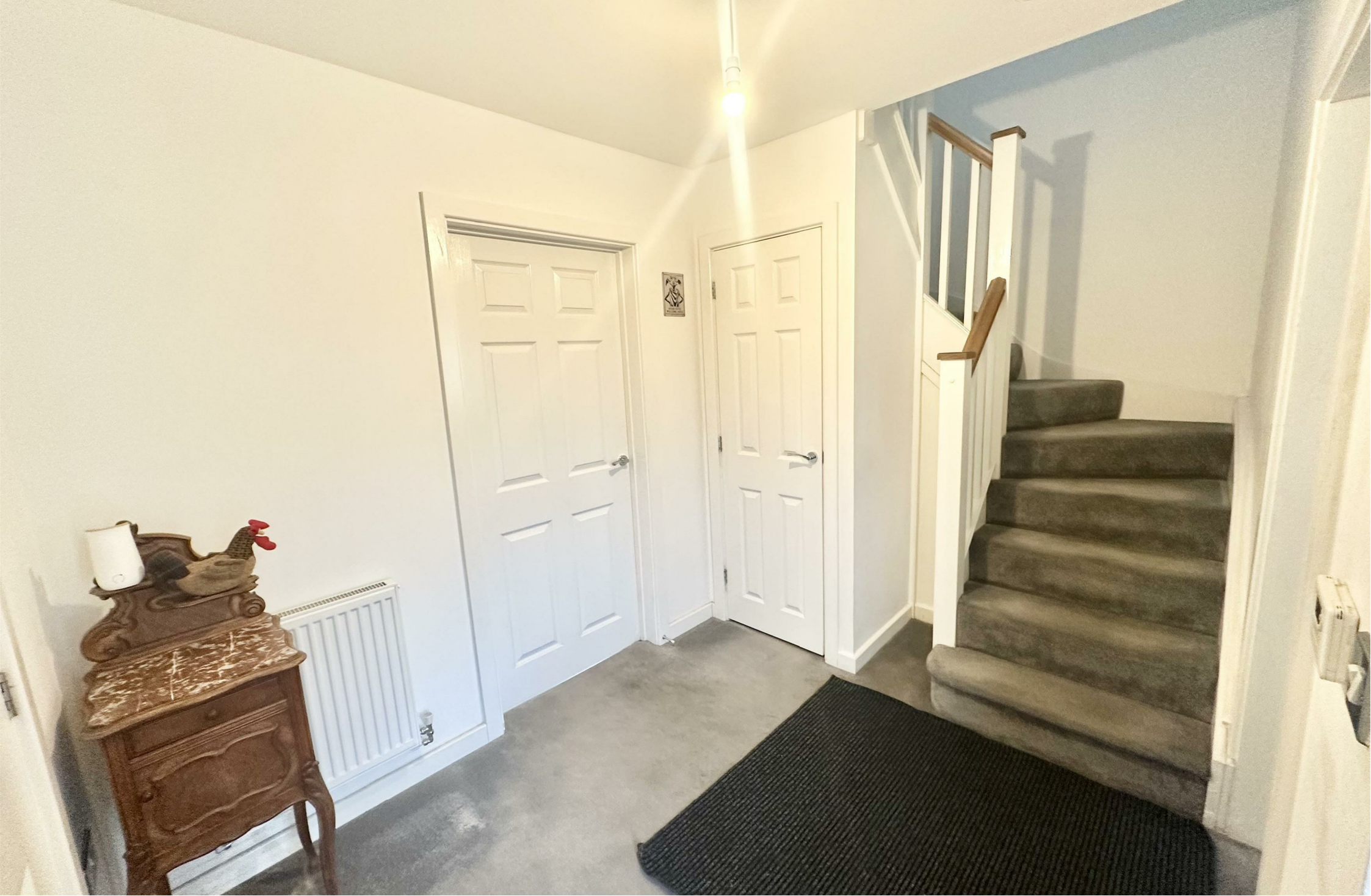
Quillet Close, St Austell, PL25 4GD